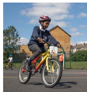
Celebration Assembly Slides and Bikeability Display